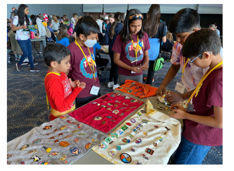
Image Description: A group of team members are gathered around a table to trade pins. In front of them are small towels, onto which their pins are attached.

guidelines on the Global Finals website.