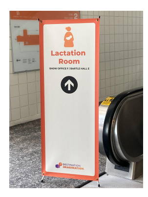
Image Description: A white vertical banner with an orange border and orange/black text. It reads "Lactation Room," with an orange icon of a nursing parent and black arrows directing to the correct room.

A private space exclusively for nursing parents can be found in Show Office F in Bartle Hall.