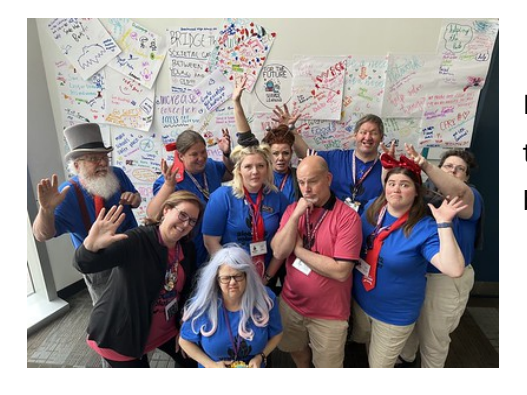
Image Description: A group of DI volunteers, wearing vibrant t-shirts and accessories, posed and smiling in a group. The wall behind them is covered in papers with colorful writing.

All tournament participants and spectators are welcome to wear comfortable, weather-appropriate clothing. Our volunteers often wear vibrant, colorful clothing and hats to celebrate the event. It is also highly likely that you will see team members in costume for their Presentations.