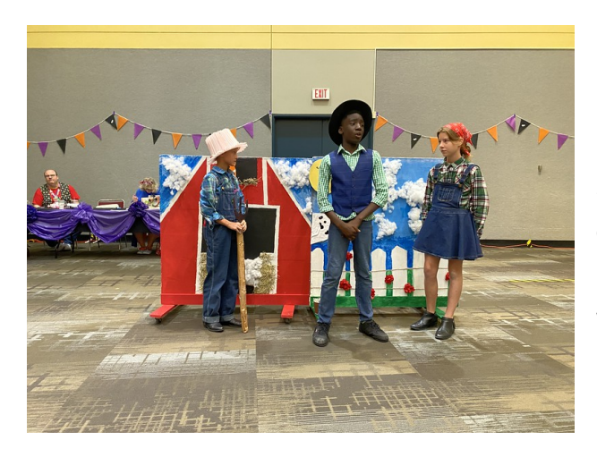
Image Description: A Presentation site from Global Finals 2022. A team is performing with colorful scenery and costumes. Behind them is an open, classroom-style space with gray carpet and walls. In the background, a team of Appraisers is watching from a table.

When the team members are done with their Presentation, the Appraisers will ask them a few questions before they leave. Audience members can remain on the Presentation Site during these questions. After speaking with the Appraisers, the team will take their Presentation materials out of the Presentation Site. At this time, parents and team supporters may help the team remove materials from the Presentation Site.