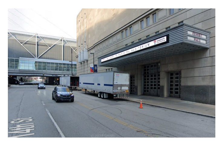
Image Description: Outside entrance of the Lower Exhibition Hall on 14th Street with a sky bridge to the left of the picture. This is the first stop for registration.

Upon arrival, Team Managers should check in at Team Registration in the Lower Exhibition Hall at 14th Street between Wyandotte St and Central St. At registration, you will receive credentials, which must be worn inside the Kansas City Convention Center.