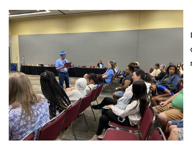
Image Description: Rows of spectators are seated in chairs, watching a volunteer who is speaking into a microphone.

Spectators will not be allowed to view any Instant Challenge presentations.