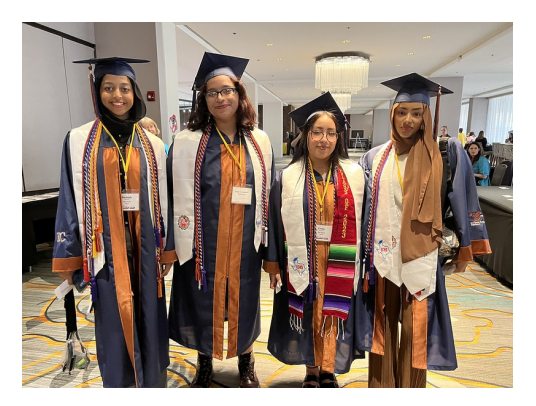
Image Description: A DI team wears graduation robes, hats, and regalia as they stand outside the Ballroom.

The Graduation Ceremony will include speeches and a slideshow presentation. Audience members are welcome to clap and cheer as they see fit.