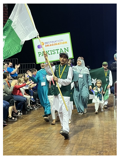
Image Descriptions: Above left, the crowd inside the Municipal Arena for Global Finals 2022. The audience is facing a stage with a colorful sign that reads "Globals '22." Above right, a team from Pakistan walks in the Parade of Nations during the Welcome Ceremony. They are carrying their nation's flag and a sign that reads "Destination Imagination Pakistan".