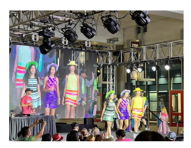
Image Description: A team wears brightly colored duct tape outfits on a brightly lit stage while an audience applauds for them. The team is also visible on a video screen at the rear of the stage.

The Box 'n' Ballers Bash will take place on Saturday, May 24 from 7:00-9:00 p.m. on the Kansas City Convention Center South Lawn. This event is a large team celebration that will include a variety of street performers such as balloon artists, caricature artists, muralists, stencil tattoo artists, chalk artists, roving giant puppets, folk dancers, and a runway fashion show. You can expect very large crowds surrounding these performers in the street as well as a lot of noise, music, and emceeing from the runway fashion show. In the case of rain, this event will move to the 1500 area within KCCC.