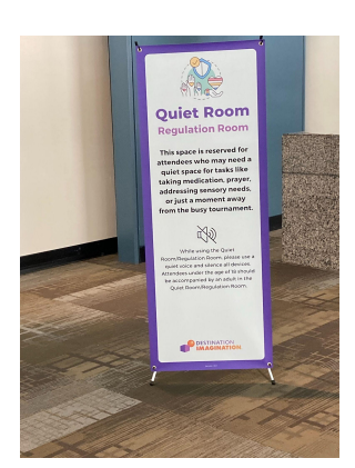
Image Description: A white vertical banner with a purple border and purple/black text. The header reads "Quiet Room/Regulation Room." Below, in smaller text, is a description of Quiet Room uses that matches what is listed in the above paragraphs.

While using the Quiet Room/Regulation Room, please use a quiet voice and silence all non-medical devices. Attendees under the age of 18 should be accompanied by an adult.