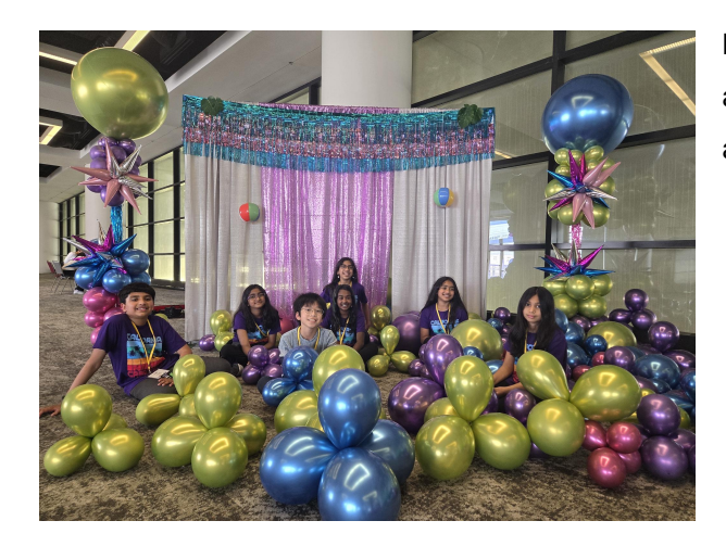
Image Description: A team of students sitting among multicolored balloons in front of a blue, pink and white backdrop.

The Alumni Council is hosting a booth in the 2300 Lobby. This area is referred to as the Not-so-secret Chill Out Space and will include hands-on activities such as yard games, coloring, and creating friendship bracelets and photo ops.