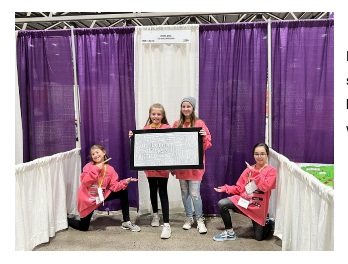
Image Description: A team poses with their team sign inside their booth at Prop Storage. The borders of their booth are lined in purple and white curtains.